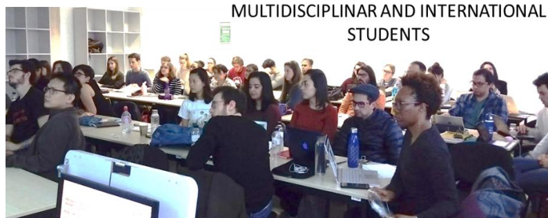
MULTIDISCIPLINAR AND INTERNATIONAL STUDENTS